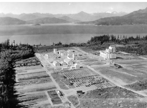
Aerial view of UBC's campus in 1925