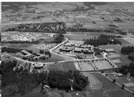
Recent aerial view of UBC Okanagan campus