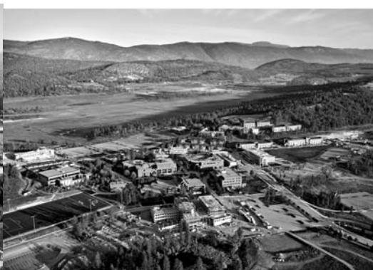
Recent aerial view of UBC Okanagan campus