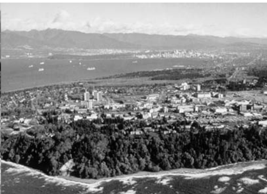
Recent aerial view of Vancouver campus