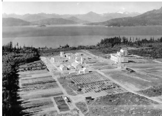
Aerial view of UBC's campus in 1925