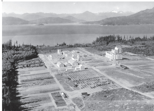
Aerial view of UBC's campus in 1925