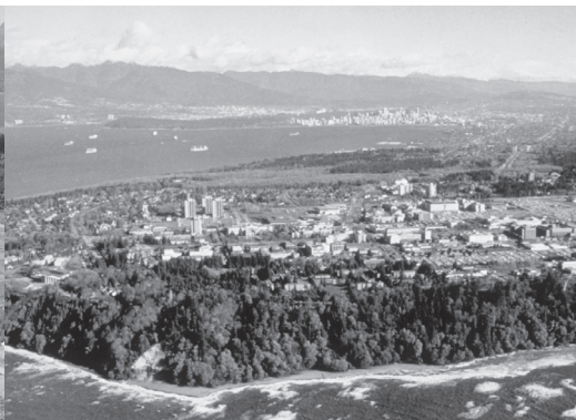
Recent aerial view of Vancouver campus