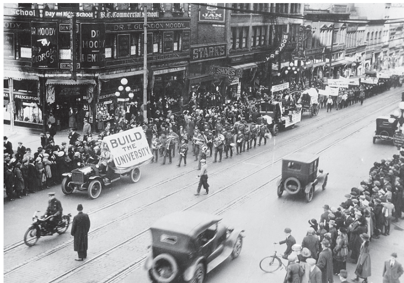
UBC students march through the streets of Vancouver in the "Great Trek" of 1922.